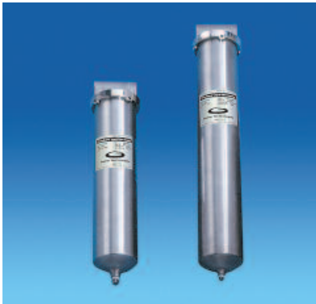
SCR Ring Closure Housing