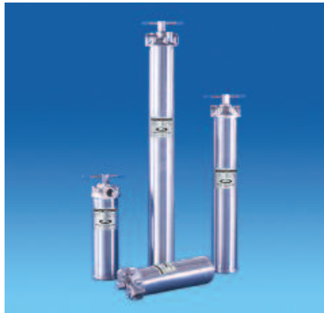
SCB Bolt Closure Housing