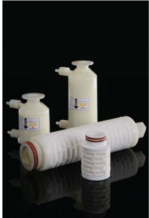
Note: PEPLYN is a registered trademark of Parker domnick hunter