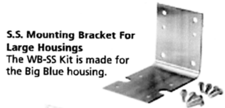
S.S. Mounting Bracket For Large Housings The WB-SS Kit is made for the Big Blue housing.