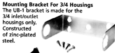
Mounting Bracket For 3/4 Housings The UB-1 bracket is made for the 3/4 inlet/outlet housings only. Constructed of zinc-plated steel.