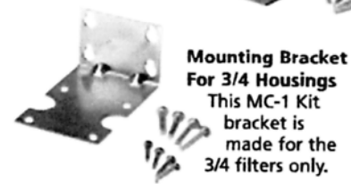
Mounting Bracket For 3/4 Housings This MC-1 Kit bracket is made for the 3/4 filters only.