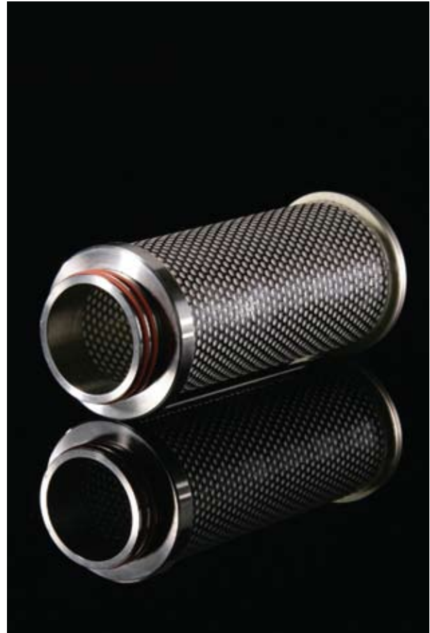
Note: BIO-X is a registered trademark of Parker domnick hunter